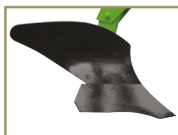
Flat (sandy soil)