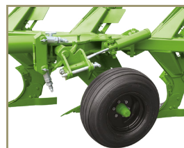
Transportation System and depth control.