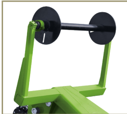
Optical fiber reel support.