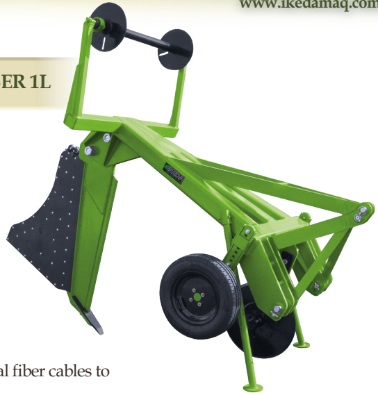
TRILLER FIBER 1L

The Triller Fiber 1L is ideal for routing optical fiber cables to interconnect 2 spots.